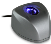
Lumidigm V-Series USB Desktop Readers

What's more, the Lumidigm MSI sensors incorporate sophisticated endpoint security technology to encrypt data to and from the device using FBI-certified encryption algorithms to prevent bad actors from accessing your networks. If a hacker attempts to gain access to the reader, the MSI device provides active tamper protection and detection features that will erase the encryption keys, preventing the hacker from accessing your keys.