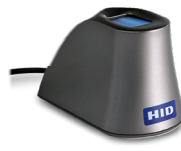
Lumidigm M-Series USB Desktop Readers