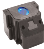
Lumidigm V-Series OEM Modules