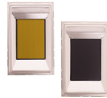
TouchChip TCET OEM Module