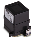
Lumidigm M-Series OEM Modules